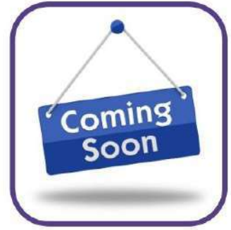
Asst. Director of Health Services 763-296-9082