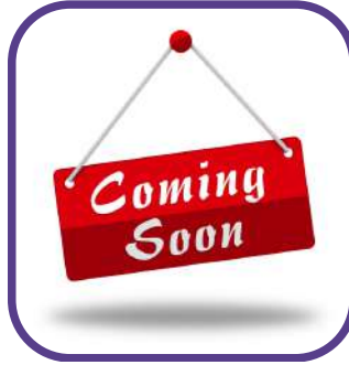
COMING SOON! Assistant Executive Director